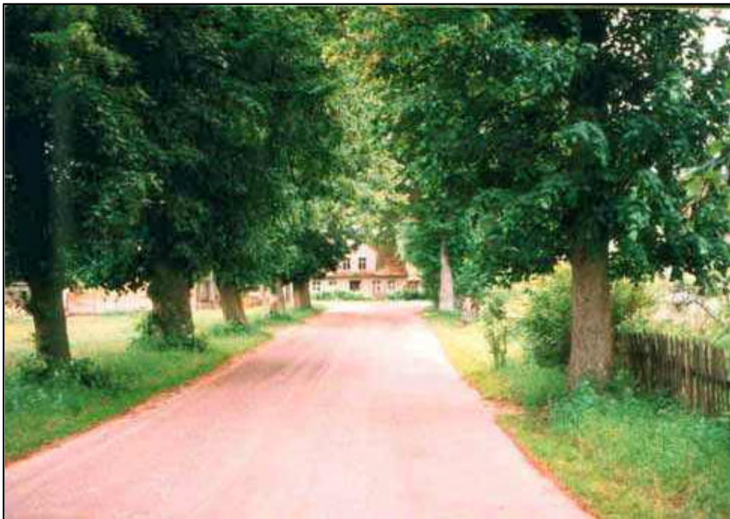
Entering the village of Hölkwiese

And, why should anyone care about this tiny village in present-day Poland? Well, if you are descended from one of the five von Presentin brothers who immigrated to the United States in the late 1860's and early 1870's, Hölkwiese looms large in your family history. It was in Hölkwiese that those five brothers and their siblings were born and spent much of their childhood.