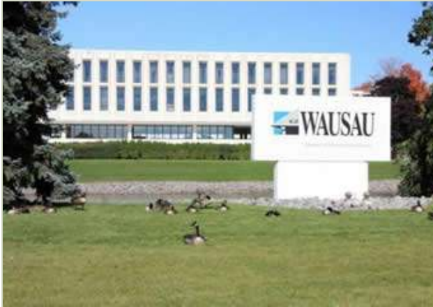
Wausau Insurance Co. Building