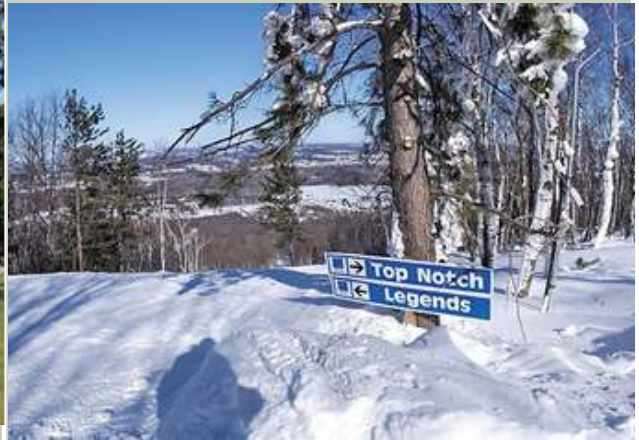
Granite Peak Ski Area on nearby Rib Mountain. The 700-foot mountain is the highest ski able mountain in the state and the second highest vertical drop in the Midwest.

Another valuable family history resource is the Wisconsin Historical Society which maintains an excellent genealogy section.