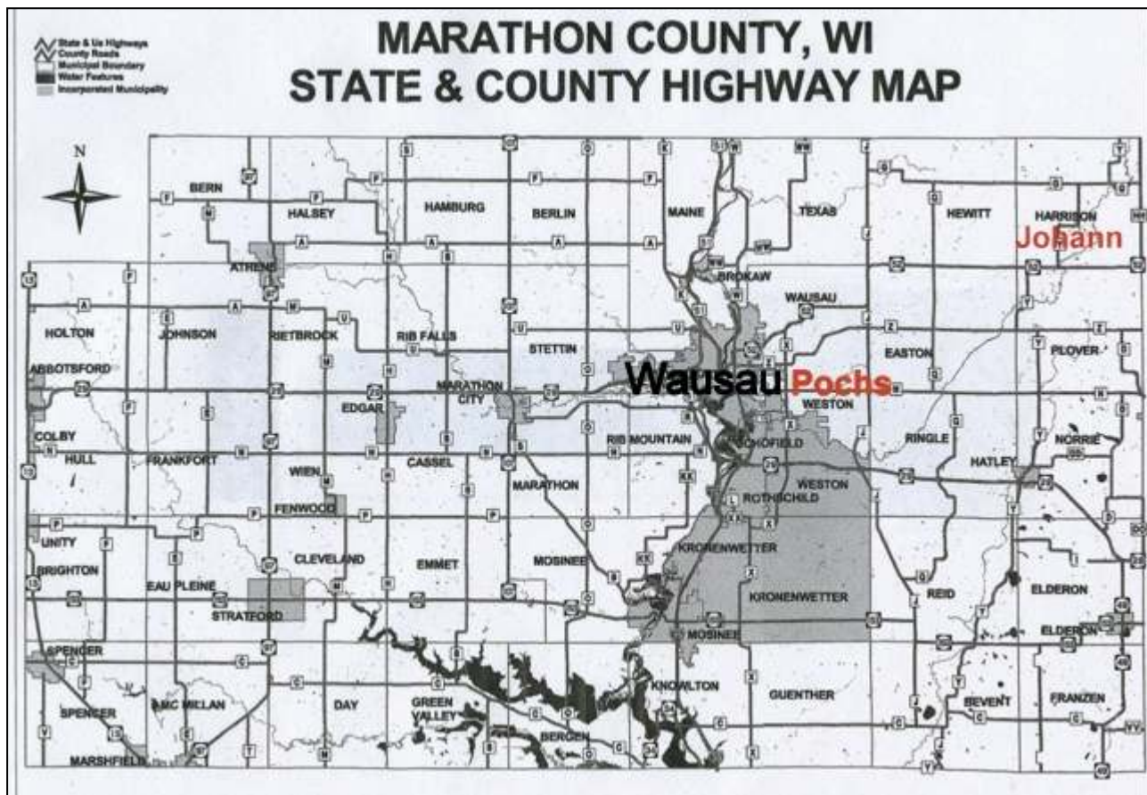
Map of Marathon County, showing Cities and Towns (shaded) and Townships The names of many Townships must reflect their German settlers.