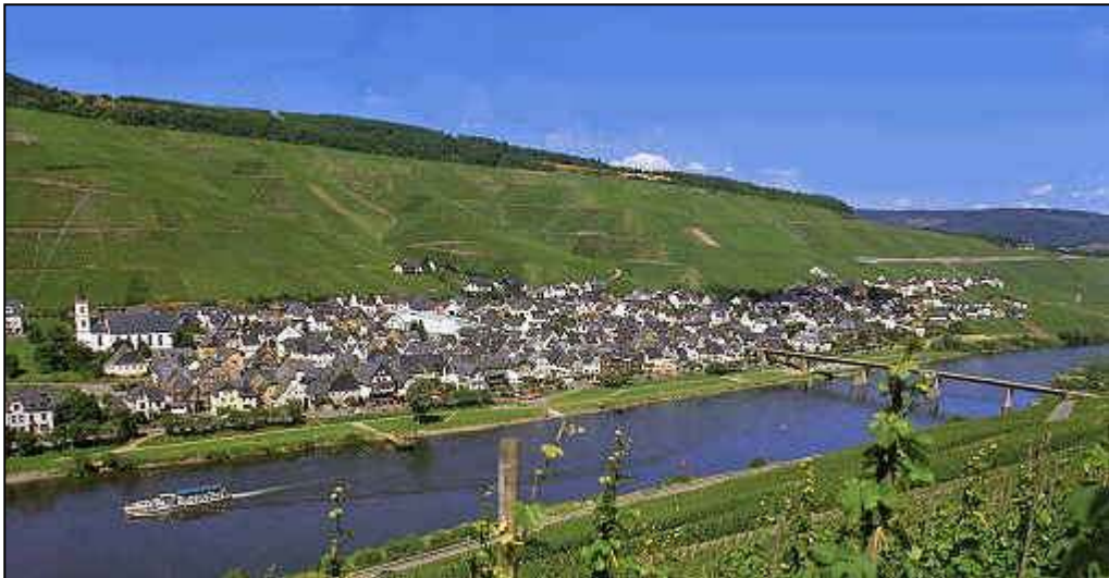
The Village of Reil, on the north bank of the Moselle River, downstream from Trier

Reil is one of many charming villages that hug the banks of the Moselle River, with vineyards clinging to the steep hillsides above. Since the Moselle River divides two mountainous plateaus, the Eifel on the north, and the Hunsruck on the south, Reil could be said to be at the southern edge of the Eifel.