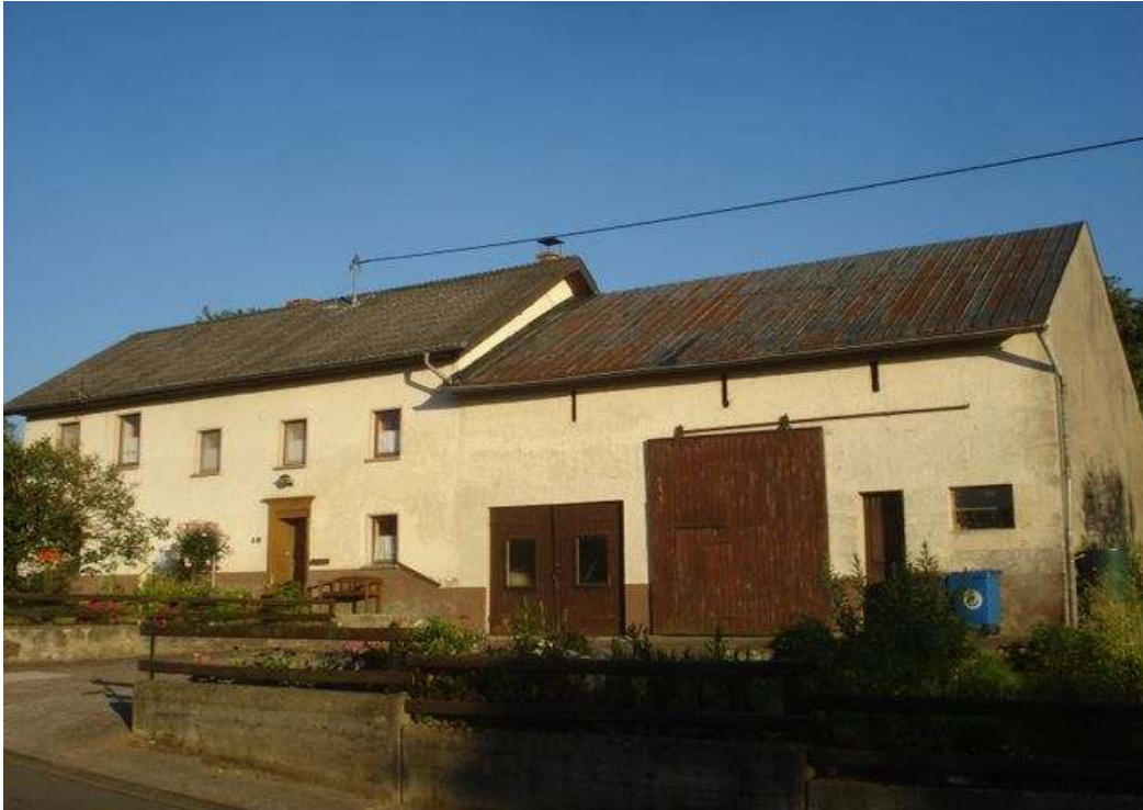
Where Matias Hommerding lived in Biesdorf, before emigrating to America [Note that the house and barn are attached]

Biesdorf (No. 5 on above map) is about 2 miles southwest of Kruchten-and is also located close to the Luxembourg border. It has a population of about 250. Apparently Google thinks Biesdorf is not worthy of its own "A" on a map. However a map of Kruchten shows Biesdorf. See Google interactive map . Kruchten is marked "A"--Biesdorf is southwest, very near the Luxembourg border.