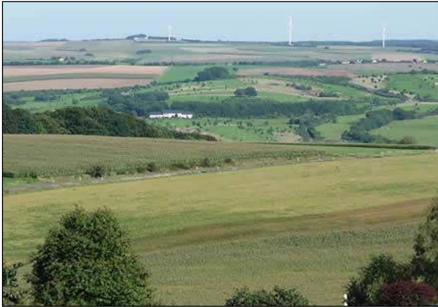
Scenery near Wissmannsdorf

Wissmannsdorf is about ten miles northeast of Nusbaum. (Shown as "A" on interactive Google map .) In 2006 it had 791 inhabitants. Its elevation is about 1100 feet.