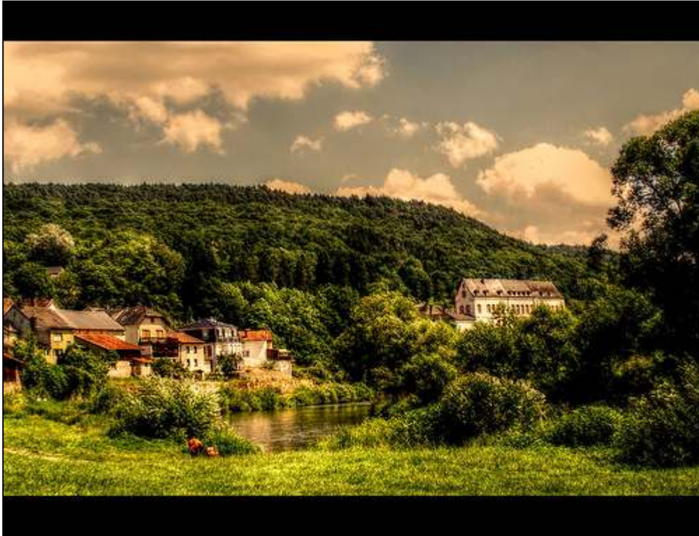
Bollendorf on the River Sauer

Bollendorf is just barely within Germany. It borders the Sauer River, which divides Germany and Luxembourg. Like many of the other villages of our Hommerding ancestors, Bollendorf's location near the Luxembourg border meant that the Allied Army in World War II came right across the Sauer River and through the town on their push into Germany. Today, approximately 2,000 people live in Bollendorf and it is described as: "A recreational village in the Southern Eifel Mountains and in the Sauer river valley in the German Bitburg-Prüm County."