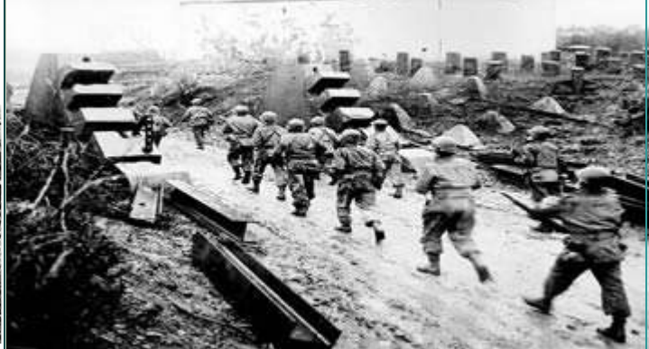
Americans Crossing the Siegfried Line into Germany