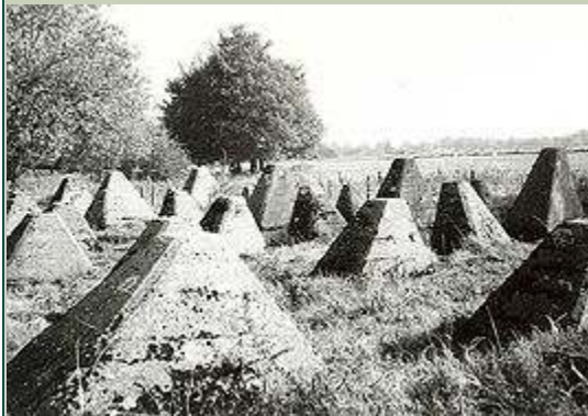
"Dragon's Teeth"--Tank Traps in the Eifel