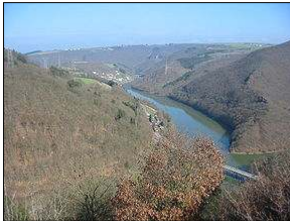
The Our River, west of Nusbaum.